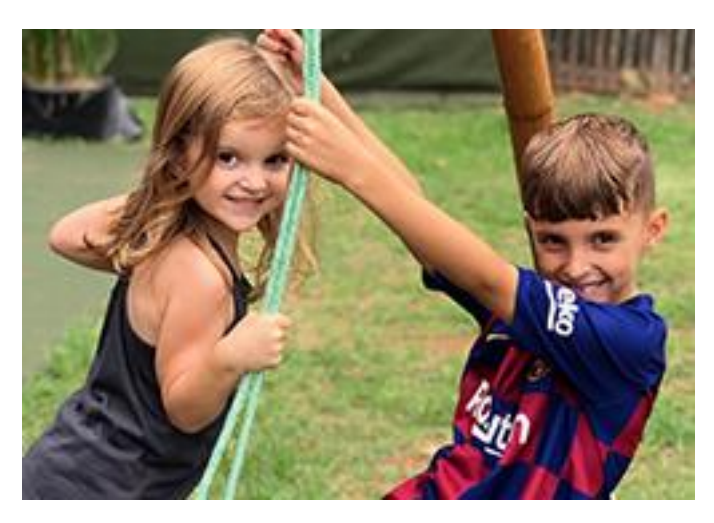
Our hope for you all is a wonderful holiday and health, happiness and prosperity in the coming New Year 2020.