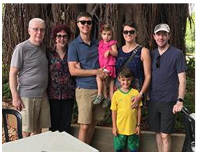
Photos: Our Family together in Brazil last Christmas and this Thanksgiving at the Iguazu Falls in Brazil and Argentina.